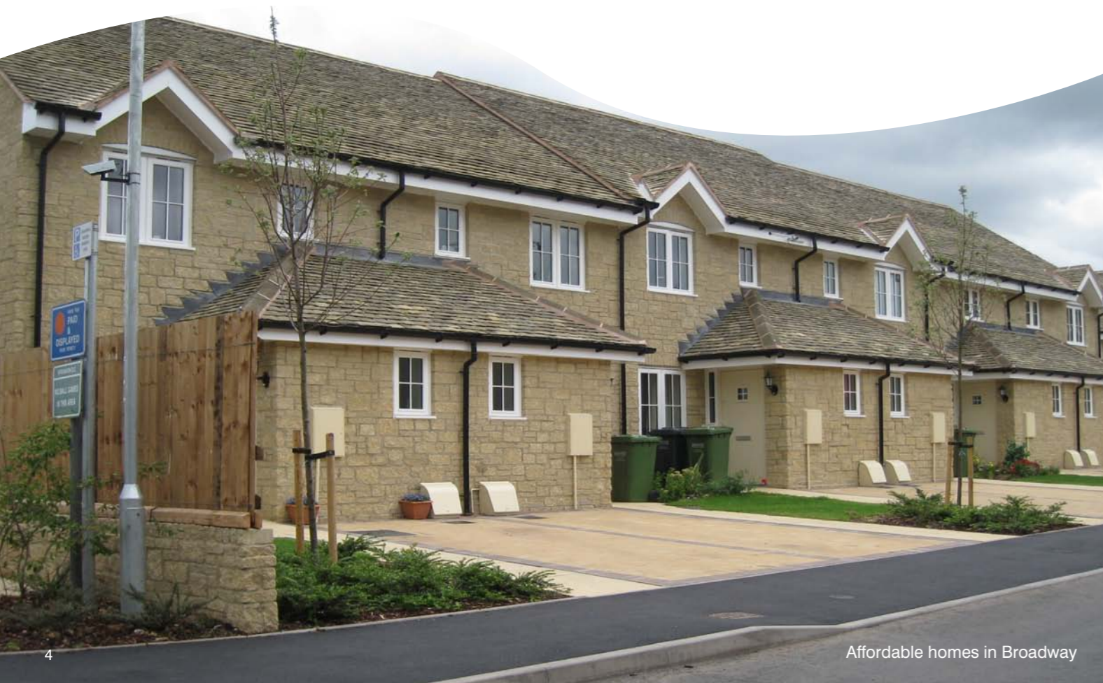
Affordable homes in Broadway

Because of the high priority that the Council puts on affordable housing delivery, it will earmark all of these additional payments (£350 per unit) for affordable housing and general housing matters in the district including bringing empty homes back into use.