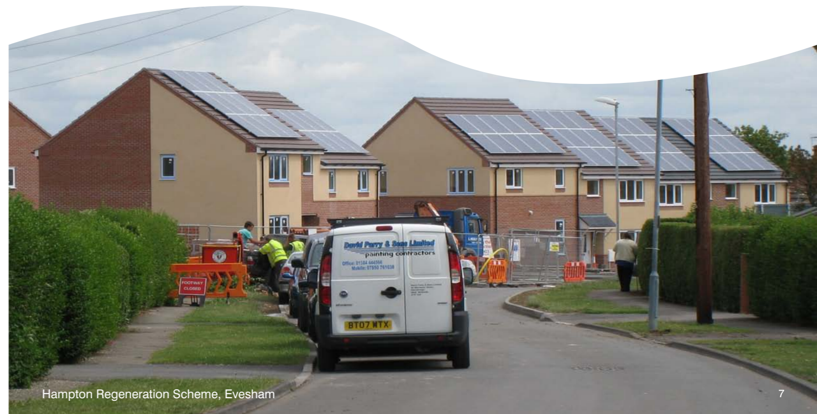
Hampton Regeneration Scheme, Evesham

The Council may determine that the NHB payments to be reinvested in local communities, in circumstances where it is serving urban growth, is split between the town and the rural parish(es) accommodating the urban growth. Of the allocation in (a) above, the split will normally be 80% to the town and 20% to the Parish.