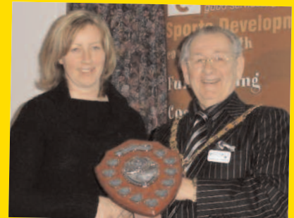
Claire Elwell Volunteer of the Year Award