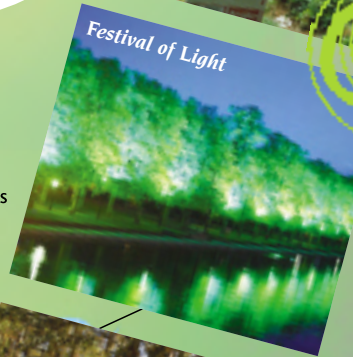
Festival of Light