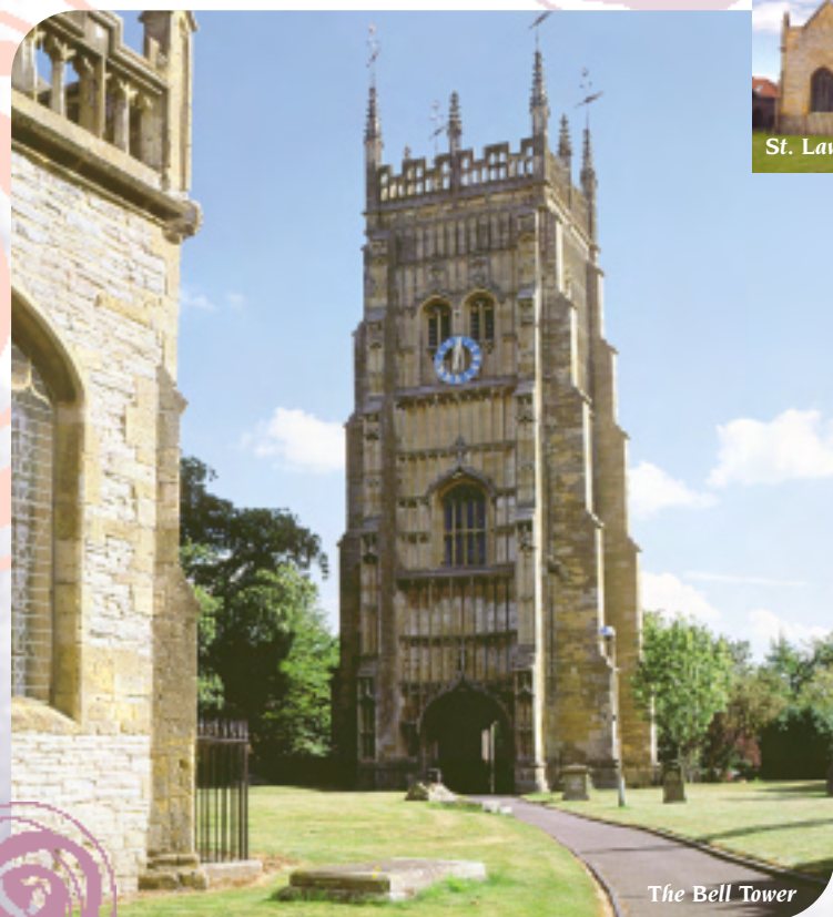
The Bell Tower

Abbey Park – Visit the site of the Abbey now an outstanding Park leading down the the famous River Avon. The park also holds the Bandstand which hosts different bands each Sunday afternoon during the summer months.