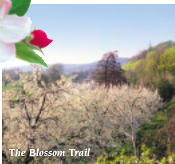
The Blossom Trail