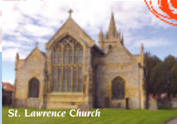
St. Lawrence Church