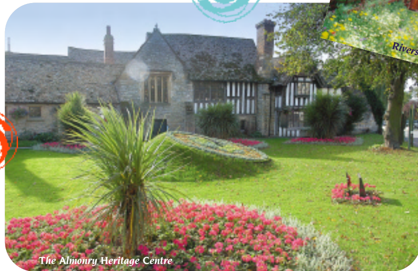
The Almonry Heritage Centre