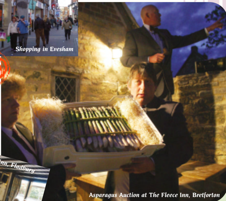
Asparagus Auction at The Fleece Inn, Bretforton