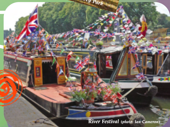
River Festival