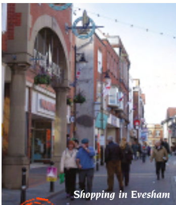
Shopping in Evesham