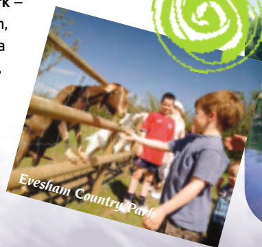
Evesham Country Park

Evesham Country Park – Set a mile out of town, the Country Park has a range of retail outlets, garden centre, restaurant, a light railway and plenty of space for kite flying or just running around.