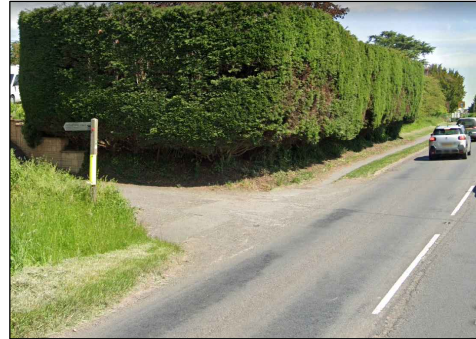
Inset A - Existing Footway and Crossing Arrangement.