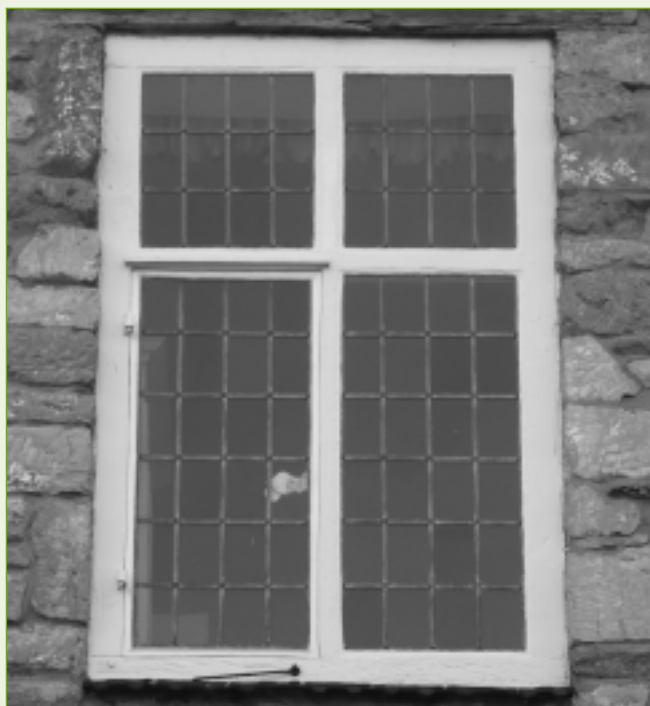
Cross casement - Elmley Castle

Windows began to conform to classical ideals at the accession of the House of Stuart in 1603 reflecting renewed contact with Europe and the classical influences of the Italian Renaissance. They became taller than they were wide, typically divided into four lights by a single mullion and transom often of masonry. As the century progressed they were increasingly constructed from timber and known as cross casement windows.