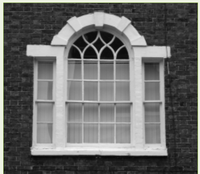
Gothic style venetian sash window - Pershore

Early in the 19th century patterns of glazing bars changed. Narrow 'margin' lights were common frequently filled with newly fashionable coloured glass. Sometimes glazing bars were curved into interlocking pointed Gothic style arches for 'Venetian' windows.