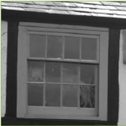
Exposed sash box - Himbleton.

Crown glass was very expensive which meant it was beyond the reach of most of the population so casement windows with leaded glazing remained popular throughout the 17th and much of the 18th centuries.