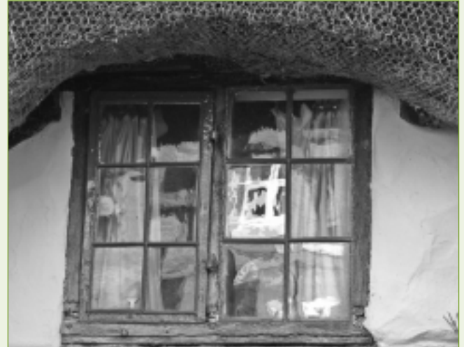
Historic Glass - Pebworth