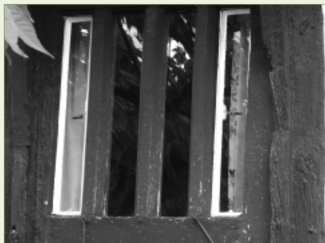
Example of an early timber window - Childswickham

Pre 16th century windows were constructed from stone mullions or timber frames with unglazed openings. They could be closed by use of sliding or folding wooden shutters, oiled cloth, paper or even thin sheets of horn. Glazed windows were used only for the highest status buildings and were constructed of small panes of glass quarrels, (also known as quarries), held together in a lattice of lead strips (comes). The lead was quite soft, so it was usually reinforced with iron bars either vertically (stanchions) or horizontally (saddle bars).