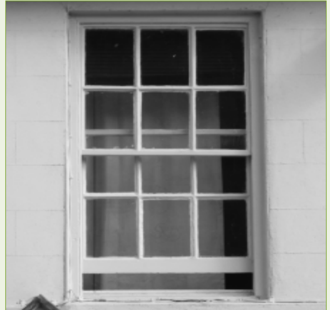
Recessed sash box - Waterside, Evesham

Throughout the 18th century casement windows were replaced by sashes. Some survived in small rural dwellings and in late 18th to early 19th century 'cottage orne'. These windows increasingly had crown glass and timber glazing bars and casements, rather than the leaded glazing and wrought-iron opening casements of earlier windows.