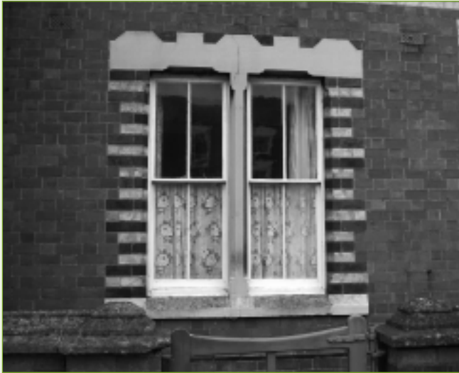
Concealed sash box - Pershore

Increased availability of plate glass meant that glazing bars could be reduced or removed completely. Improved methods of manufacture made glass less expensive from 1837. By mid century most windows had only one central glazing bar or none at all. 'Horns' were introduced to compensate for the increased weight of plate glass and lack of glazing bars.