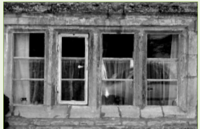
Larger mullioned subdivided window - Offenham

Tudor stability and prosperity was reflected in window size. The much larger windows were subdivided into smaller openings (lights). Both stone and timber had vertical bars (mullions) and horizontal bars (transoms).