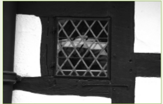
Leaded casement with stay - Childswickham

Stone mullions were moulded on both inside and outside faces, usually with either a chamfer or cavetto moulding. Timber window frames were usually oak with pegged mortice and tenon joints and similarly moulded in imitation of more expensive stone.